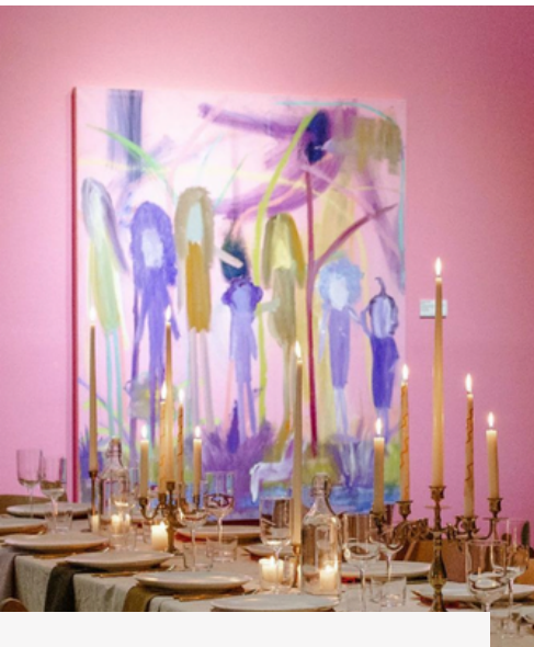
Artsper x Spoak