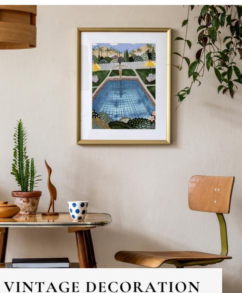
VINTAGE DECORATION See more