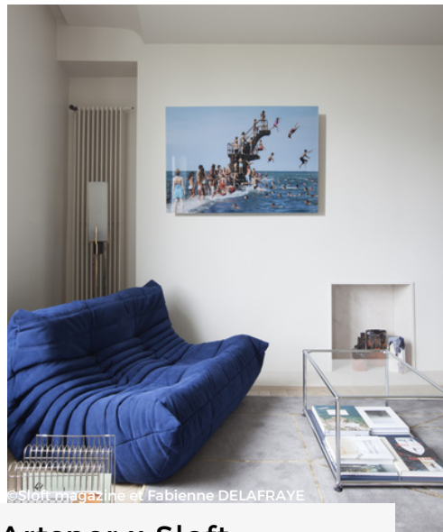
Artsper x Sloft Magazine