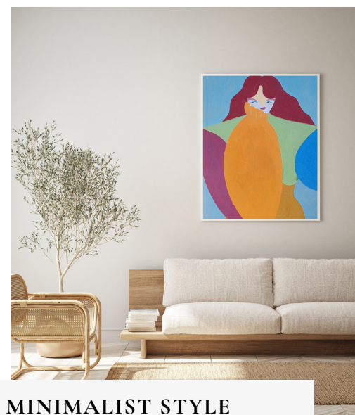
MINIMALIST STYLE See more