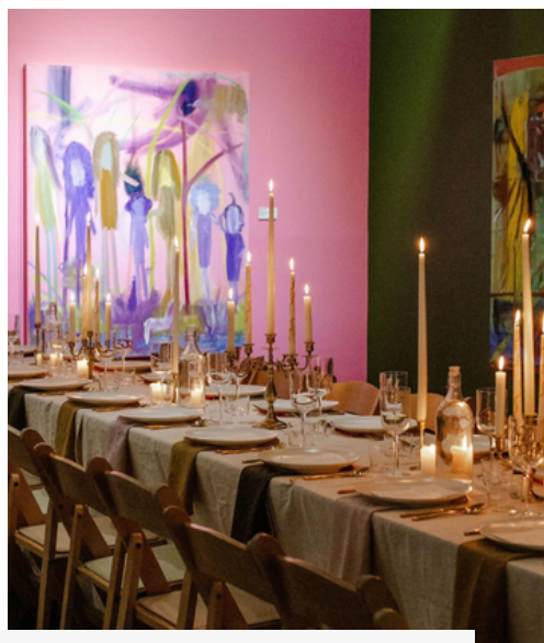
Artsper x Spoak