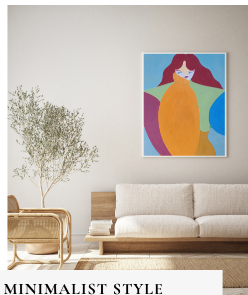
MINIMALIST STYLE See more